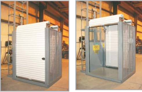
Roll up doors