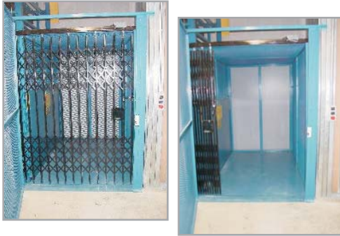
Freight style folding gates

All our cabs can incorporate electrically interlocked gates and doors exceeding the Requirement of ANSI/ASME B20.1